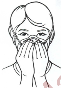
Figure 3 Positive pressure user seal check – Disposable filtering facepiece respirator

For disposable respirators, the user seal checks are done somewhat differently. For non-valved disposable respirators, both hands must be placed completely over the respirator while the wearer exhales. The respirator should bulge slightly. For disposable respirators that have a valve, both hands should be placed over the respirator and the user inhales sharply. The respirator should collapse slightly. If air leaks at the edges of the respirator, it should be re-positioned and adjusted for a more secure fit and the test repeated. If the seal check cannot be successfully completed, another type/style/size of respirator should be tried.